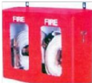
FIRE FIGHTING & DETECTION SYSTEM