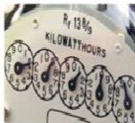
ENERGY SERVICES & AUDITING