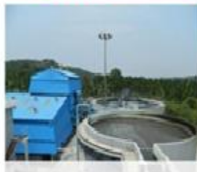
WASTE & WATER TREATMENT SOLUTIONS