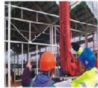
PROJECT MANAGEMENT SERVICES

MEP DESIGN-BUILD ENGINEERING SERVICES *HVAC * HT/LT ELECTRICAL * BUILDING AUTOMATION *FIRE PROTECTION * PLUMBING & SANITARY *WASTE & WATER TREATMENT SOLUTION ENERGY AUDITING & ESCO *DETAILED ENERGY AUDITING * ELECTRICAL FIRE/SAFETY AUDIT *AIR QUALITY AUDIT * SOP WATER AUDIT SOLAR / RENEWABLE CONSULTANT GREEN BUILDING CONSULTANCY PROJECT MANAGEMENT CONSULTANCY SURVEY-ENGINEERING SERVICES (SMART CITY)